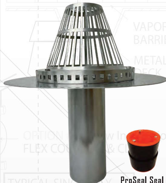
W/ SS Ring & Dome

Our Poseidon SS Flange has the option to be PVC or TPO Coated for direct hot air welding of PVC and TPO type roofing membranes.