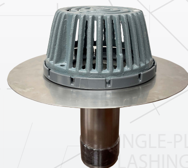
W/ Cast Iron Ring & Dome