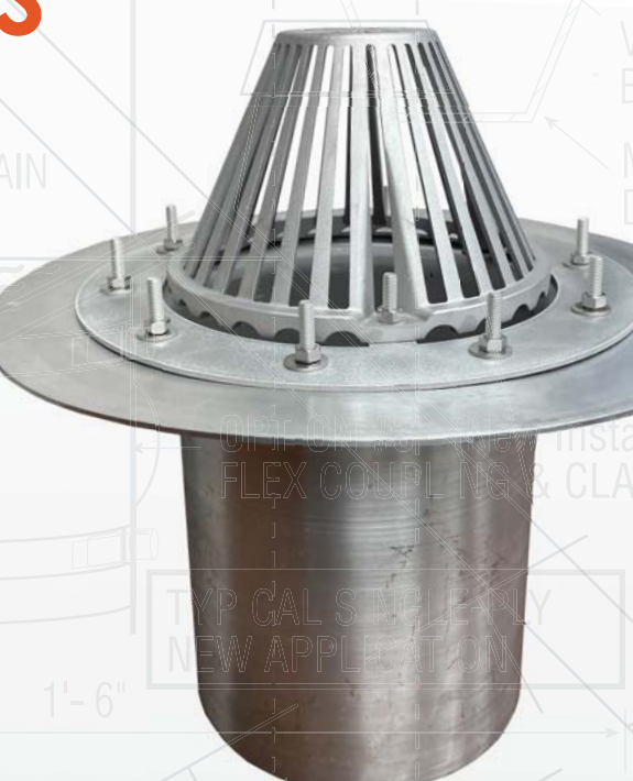
W/ 10" Aluminum Dome and no expanding tape