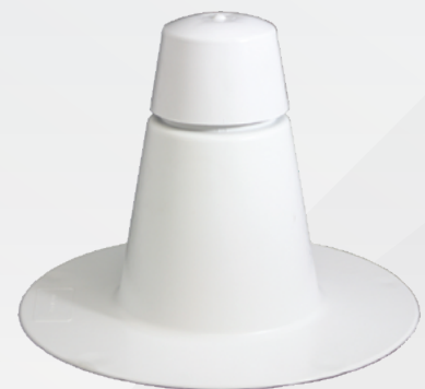
PVC or TPO (White)

High-density polyethylene (black) vent for BUR and Bitumen applications, UV stabilized PVC (white) for PVC Membrane applications and TPO (white) for TPO membrane applications.