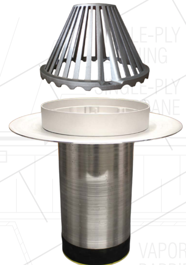
Aluminator with overflow ring

Due to variations in manufacturing and job site inconsistencies the above data are guidelines only and are not guaranteed for any specific situations.