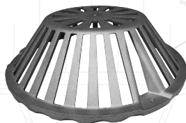
Low profile aluminum strainer