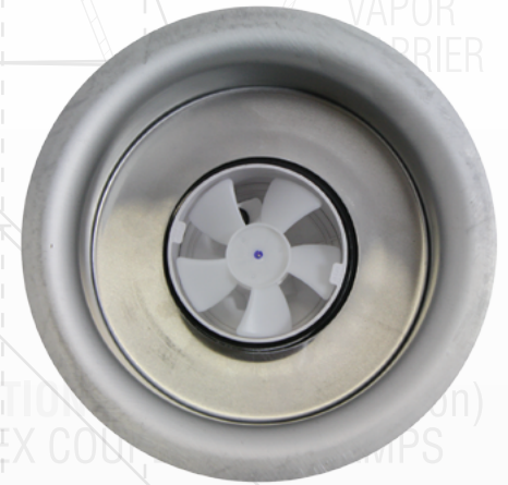
The solar powered fan mechanism viewed from the under-side of the vent.